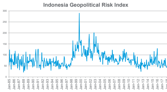
Caldara, Dario and Matteo Iacoviello, "Measuring Geopolitical Risk," working paper, Board of Governors of the Federal Reserve Board, January 2018

Geopolitics includes broad and complex interrelated issues such as climate change, outbreak of disease, political instability, war, conflict, and economics, which can present risks with little or no notice. Business leaders should start to include geopolitical risks into their areas of attention.