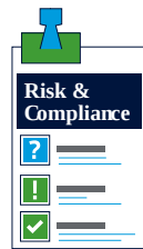
Risk & Compliance